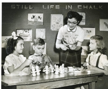
Marshmallow Snowmen South Wood County Historical Museum