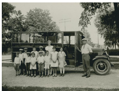
School bus, Ranke School, 1931