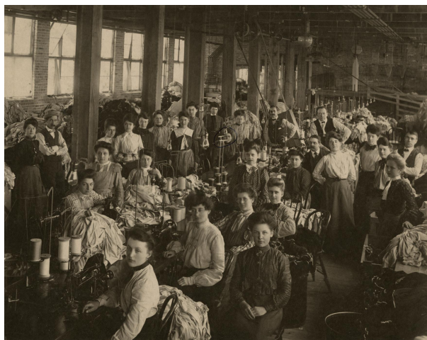
Cooper Underwear factory employees, ca. 1900