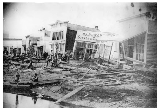
Wisconsin Rapids Flood of 1880