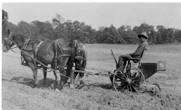
Planting potatoes, ca. 1915 New Berlin Historical Society