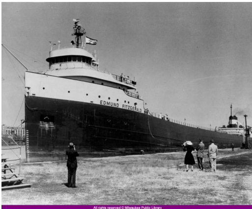
Onlookers of the berthed ship Edmund Fitzgerald, 1959