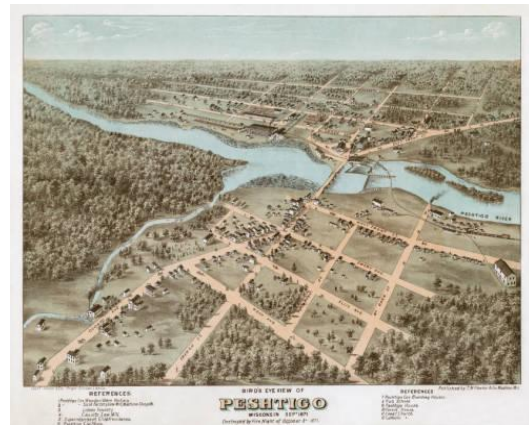
Bird's Eye View of Peshtigo, 1871