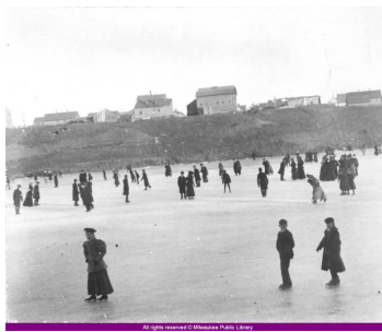
Ice skating on the Milwaukee River, 1897