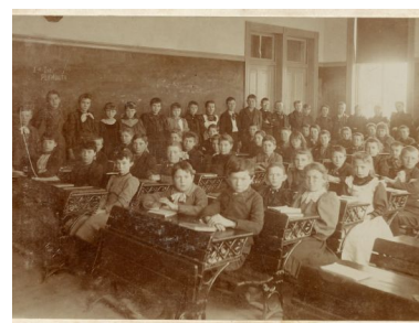
First Grade class, U.S. Grant School, 1937