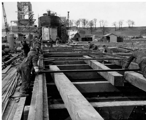
Kewaunee ships of war, 1941-1946