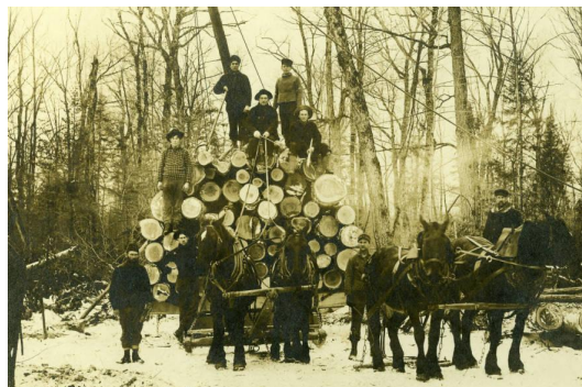
Logging crew hauling timber